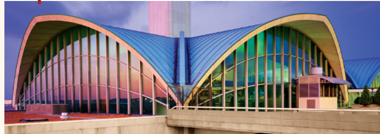
Lambert–St. Louis International Airport