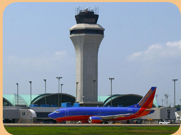
Southwest Jet at Lambert–St. Louis International Airport

Air Canada Air Choice One Air Tran Alaska Airlines American/American Connection/American Eagle Cape Air Delta/Delta Connection Frontier Airlines Southwest United/United Express USA 3000 USAirways/USAirways Express