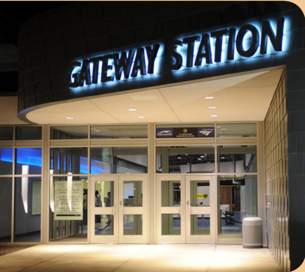
Gateway Transportation Center