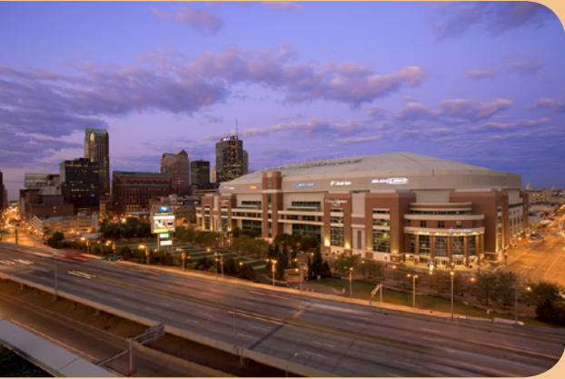
Interstate 70 near the Dome at America's Center