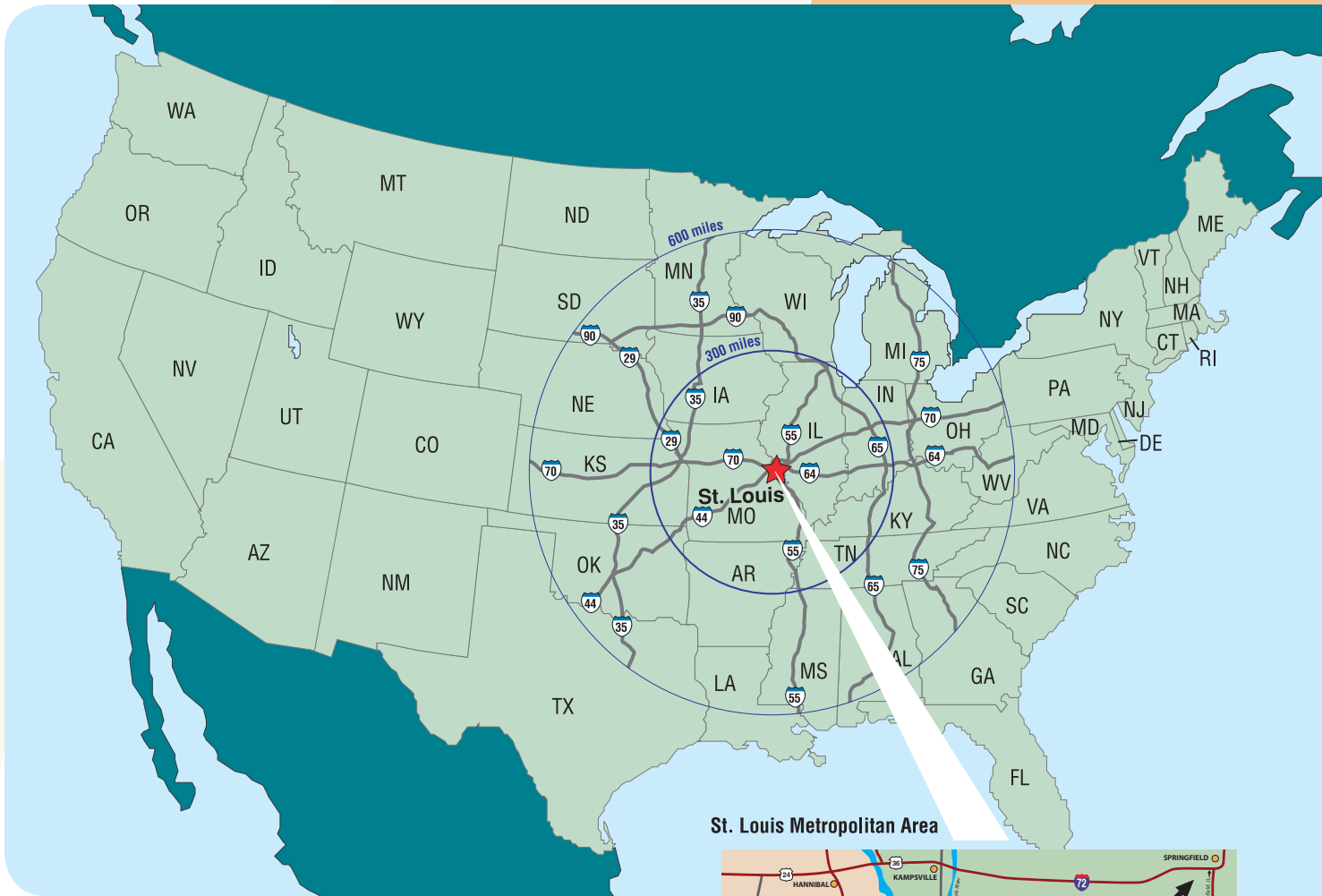
St. Louis Metropolitan Area